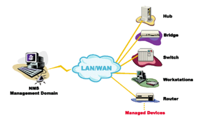
A typical scenario of a management application managing multiple devices over a LAN/WAN.

Until recently, the only way for IT professionals to evaluate enterprise management applications – either element managers, frameworks like HP OpenView NNM, or valueadded applications – was to use it with their production network, or have an extensive multi-vendor hardware test lab. Using the mission-critical production network for testing is very risky, whereas a test lab can become very costly and can be time and space consuming. The equipment needs setup, maintenance and regular updating of devices and software releases. Current IT budget cuts require an alternative to the physical lab.